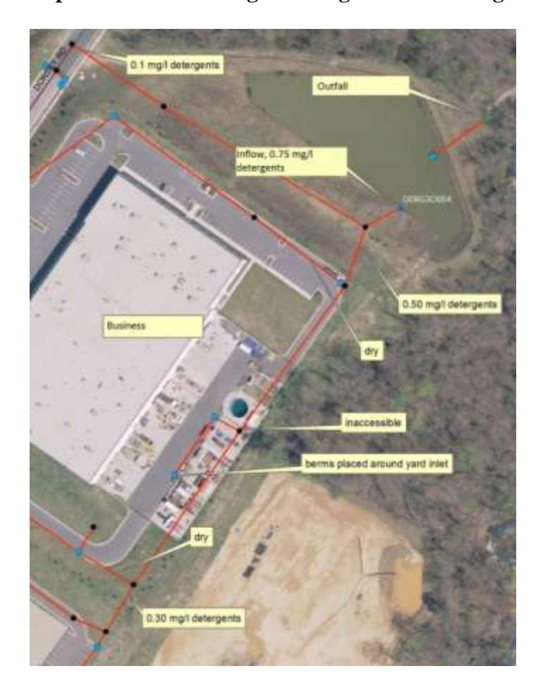
Example 2: Illicit Discharge Investigation for Detergents

A dry weather flow was discovered at the outfall of a BMP. A chemical test revealed the presence of chlorine and a high pH. A chemical test at the pond inflow indicated a high level of detergents. Upslope manholes were inspected to determine the path of the discharge. Starting at the point of discharge and inspecting contributing segments of stormwater conveyance pipes (sometimes called a trunk investigation), a single point of flow that exceeded the acceptable level of detergents was isolated. The investigation revealed that the source of the discharge was located within the segment connected to inlets protected by berms on a private commercial business property yard.