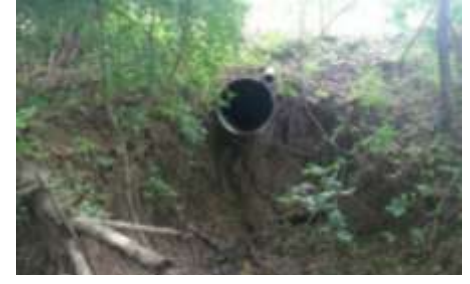
Figure B.1. The above outfalls are examples of different types of outfalls that must be identified on MS4 maps and included in the permittee's screening program. Areas with highly developed land uses (e.g., commercial business complexes, aging infrastructure) have a greater potential to pollute and must be prioritized. Structural stability and erosion concerns should also be identified as part of an effective IDDE program.

Permittees must develop SOPs that outline methods to conduct dry weather outfall inspections, locate